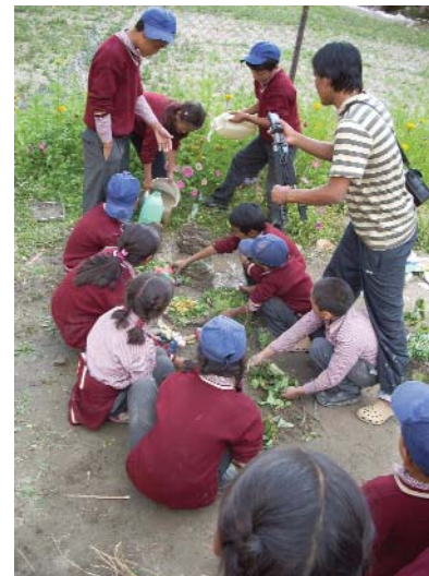
THE FLOODS AT DOMKHAR BARMA Book and Movie by the Children of Domkhar Barma Middle School