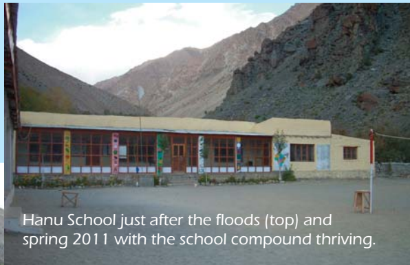
Hanu School just after the floods (top) and spring 2011 with the school compound thriving.